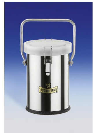
Dewar flask 26 B-E