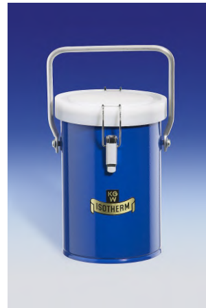
Dewar flask 26 B